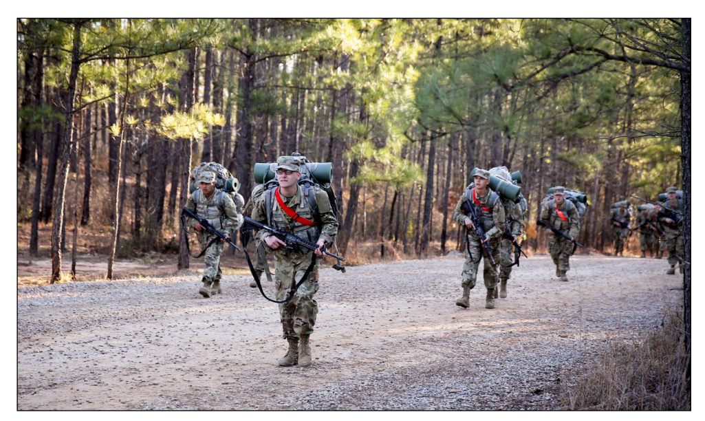
Soldiers in training with Bravo Company, 1st Battalion, 50th Infantry Regiment, road march to a land navigation training site on 13 February 2017 at Fort Benning, GA.

In response to the increased focus on readiness, specifically within the Infantry force, leadership within the U.S. Army Infantry School approached the 198th Infantry Brigade, which trains all Army Infantry forces, and asked what could be done to make better Infantry Soldiers.